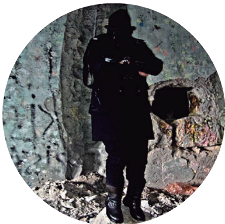
Imagem 2: Hugo Paquete / Performative action for silence in and out with the air and gravitational forces of the universe / Sound action in site / At Sanatório Valongo, Portugal / Year: 2012

In light of the presented ideas, it remains true that, because to the mechanisms we invented, humanity has never before had such a sophisticated perceptual relationship with space in a performativeness aspect. The idea that everything is a place but not everything is an object is built up, and the place blurs in fragments into numerous places and virtual things as hybrid-space and the demand for a Meta-escuta 4 (Paquete, 2015) and hybrid sensibility.