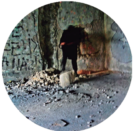
Imagem 1: Hugo Paquete / Performative action for percussion with a rock / Sound action / At Sanatório Valongo, Portugal / Year: 2012