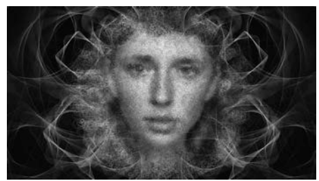
Figure 2 - A screen capture of Alchimia where the original face is modulated by an Egyptian mask

In order to understand and document the behaviour of the interactors with the artwork, the author observed how and for how long different audience members were