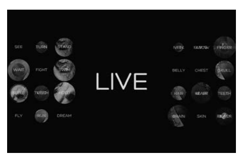
Figure 6 - The "life-death" culmination of a full cycle in SAR

As with Alchimia, the progression of the generative process also increases its dynamics, until it reaches a new state. Unlike the oracle in Alchimia, this new state is the life-death cycle, common to all beings, human and non-human alike. At this point the screen is filled with words describing body parts and actions performed by living organisms and the system begins to slow down in pace and intensity. Finally death marks the end of the cycle, only for the whole generative process to start anew. Also like Alchimia, SAR uses a real-time generated soundtrack to achieve synchronicity with the visual animation, thus reinforcing SAR's cinematic experience. This soundtrack relies on ambient noises of wind, rain, insects, birds, and also on distinct tribal rhythms and instruments from all over the world, modulated with digital sound synthesis and effects. Over the soundtrack different human voices utter "I am" in various languages, recorded through Google Translate voice synthesis function.