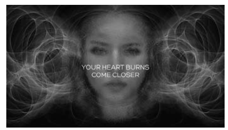
Figure 3 - A screen capture of Alchimia depicting one of the oracular teasers

The teasers served two distinct purposes: they allowed for the current interactor to achieve closure in their interaction with the artwork, but they also were found to trigger the desire in other watchers (potential interactors) to take part in the performance, and thus present them with the opportunity to do so, replacing the current interactor. The numerous textual teasers include statements such as am I human?, is this me?, we see your soul. look into our eves, you are not digital. come closer, is that your fear?, step into the light, reveal yourself, I cannot feel you, which are all open to interpretation as well as mystery. The interaction cycle length was adjusted to facilitate access to this moment of revelation. The sense of crescendo toward a climax was enhanced by means of the soundtrack, as well as a faster modulation of the face image, so that the interactor had less time to adjust to each new state. It was documented that some audience members remained for several cycles (the largest number of documented consecutive cycles was nine, with a rough temporal equivalence to nine minutes).