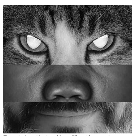
Figure 4 - A combination of three different faces produces a new digital mask

and a second aesthetic perspective, inspired by the worldwide mask-making tradition, rooted in animism. totemism, shamanism, ritual and mythology, stressing the relationship between human and nature, where the ideals of a permeating energy that binds every biological and non-biological entity reinforces the interconnectedness and collaborative nature of the world. The dual nature of the mask, perceived as both an exotic enigma and a familiar presence, implies that they are not mere pictures of other beings; they constitute a means to attribute or predicate the identity of those beings to the mask-wearer, to articulate power between the wearer and the seer and to appeal to psychological and cognitive processes. Masks have the function of transforming identity, either by modulating the representation of identity, or through its temporary and representational extinction and replacement with a diverse identity. They embody a modulation of the self(ie), through the transformation of the human into a being of another order (Pollock 1995).