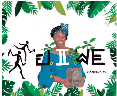
Image 5 - Wangari Maathai

I was working with Wangari Maathai after she received her Nobel Peace Prize for environment conservation. She was explaining that conflicts and particularly tribal clashes in Africa, more specifically in north of Kenya, are mostly the consequences of food and water shortages... if you don't have food to give your children, if they don't have any water to drink, if they are dying, what else is left but jumping over the wall to get the food and water from your neighbor... basically a man becomes extremely dangerous when in desperation, more so when he feels he has nothing to lose... not even life!