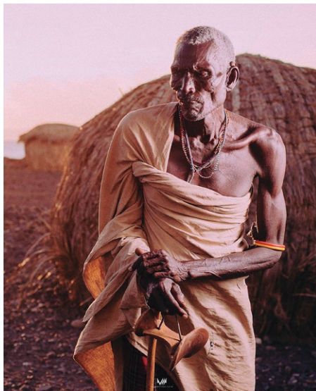
Image 3 - El Molo tribe male figure