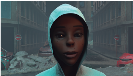
Image 4 - Ophelia in Usoni the game

In the world of USONI, Ophelia is a kind of anti-system model, a free woman, walking outside the box, an altruistic individualist, a positive rebel... a resistant. The first images of Ophelia are those of a humble, modest woman whose only ambition is to give birth to the baby she carries within her under the African sun and not in the land of shadows that France has become. Paris, once the City of Lights, is in 2062 the city where the light has gone out forever. The analogy with what has been happening for years for women "from the south", especially in Africa where in some countries, women have no choice but to flee their homes to give their children a chance of survival... to go and find the sun that has disappeared from their lives. For how many women this sun of Africa no longer shines! This sun may burn their skin, dry their lips, kill their cattle, but it does not shine for them. And they think that the sun can shine for them in green Europe... a bitter disillusionment in most cases! Ophelia was born in darkness, in a world from which light has disappeared. Usoni is the story of her journey to the light. She carries life within her, like any pregnant woman, but in Ophelia's case the symbol goes much further, much higher... Ophelia carries within her the life of a world that will completely disappear in favor of a