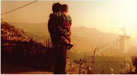
Image 2 - From The Journey to the End of Coal